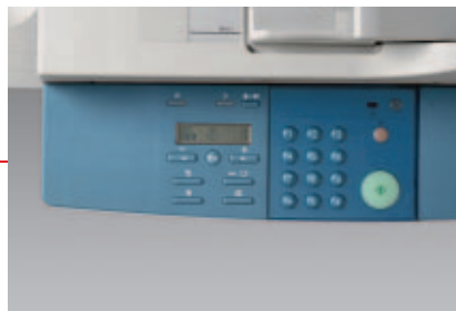
Clear control panel for ease of use