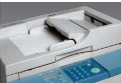
Productive Automatic Document Feeder

Busy offices faced with larger document workloads will find the optional Automatic Document Feeder (ADF) offers the easiest way to increase efficiency. It allows the machine to scan and copy all your multi-page documents automatically, leaving you free to get on with more important work.