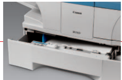
High capacity 500-sheet paper cassette